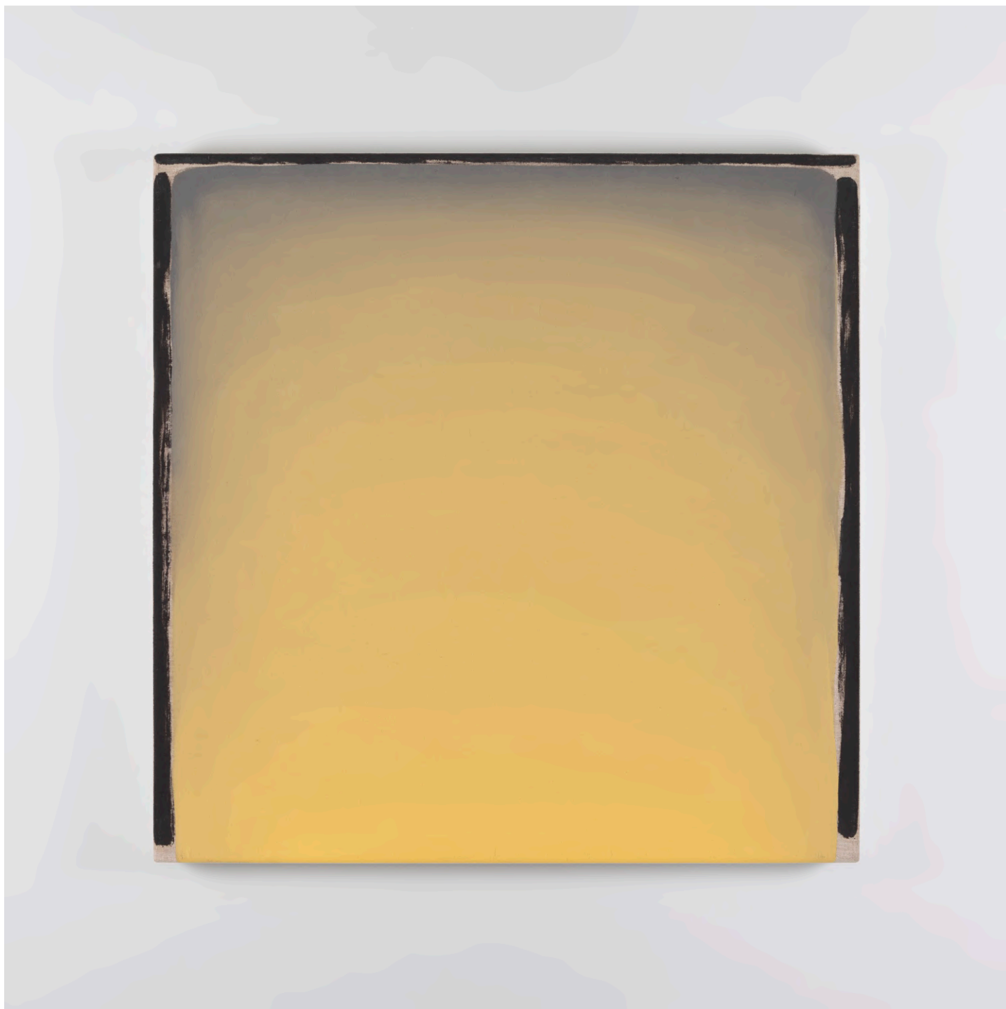
Untitled (2009 - 2011) oil on linen 45.5 x 45.5 cm / 17.9 x 17.9 in WMcK348