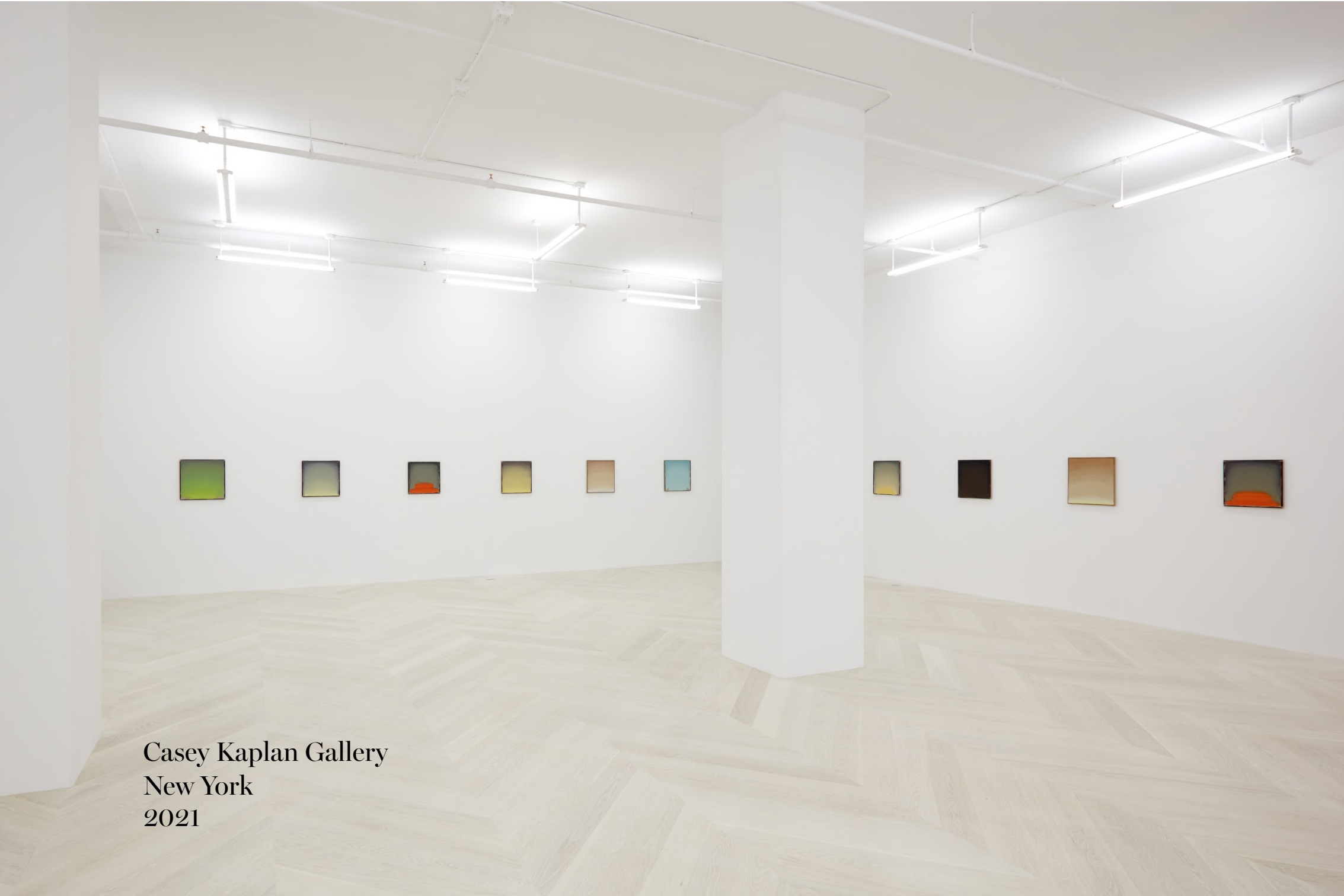
Casey Kaplan Gallery New York 2021