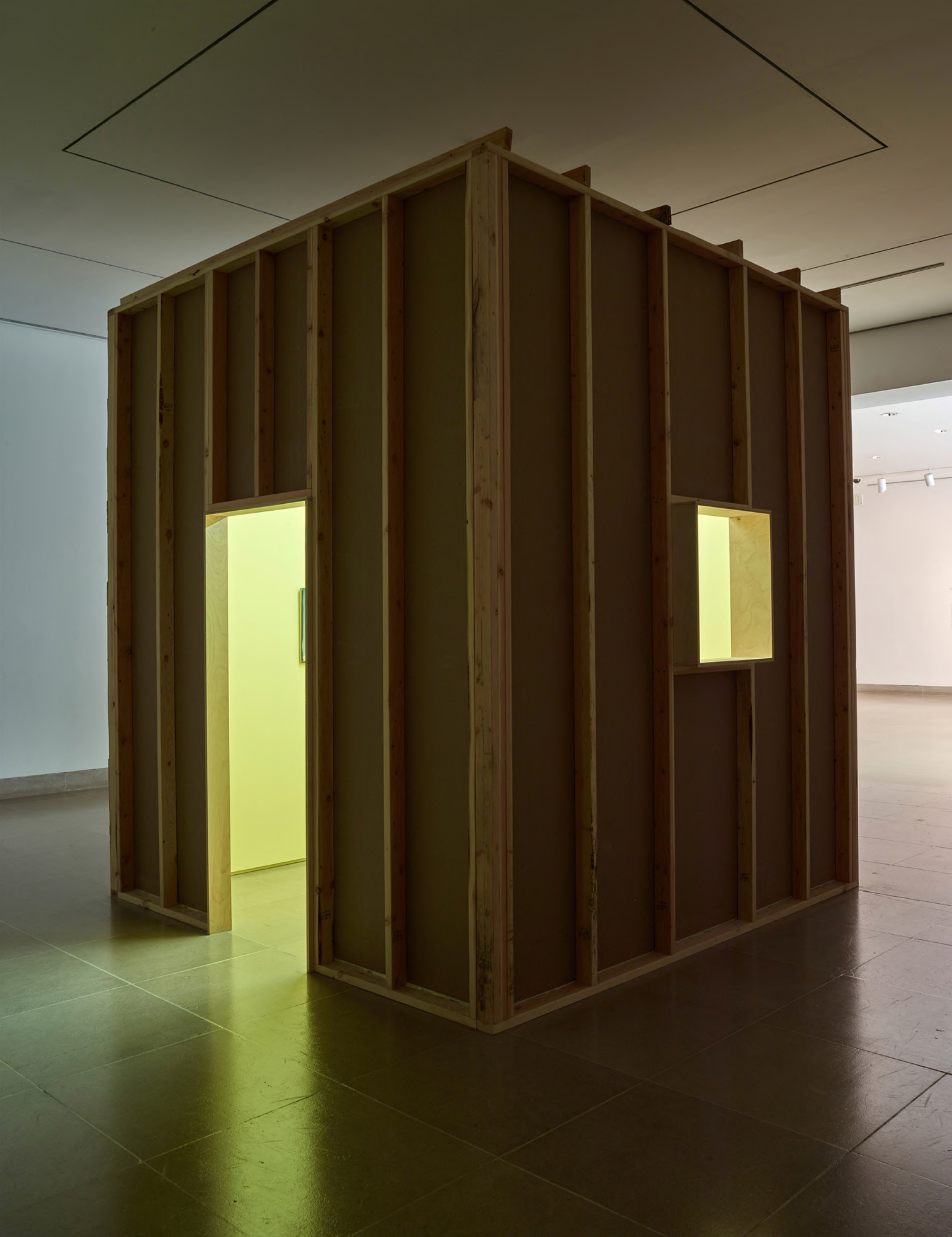
The Dayroom 2004-2010 (Recreated 2012) a room, a painting, and a drawing, wood, paint, electrics 348 × 348 × 348 cm / 120 × 120 × 120 in

Collection of Dallas Museum of Art, 2016