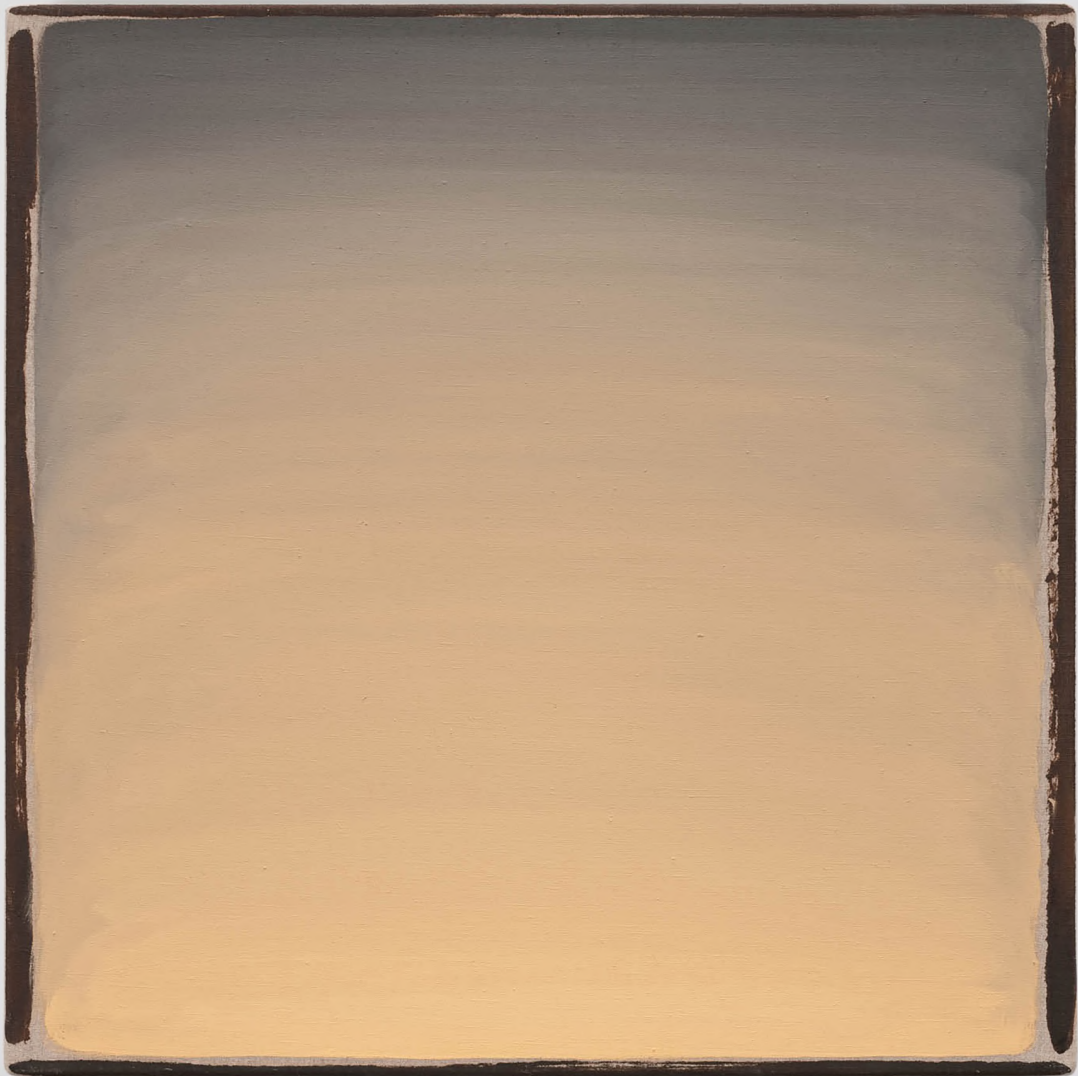
Untitled 2008 oil on linen 45 x 45.5 cm / 17.7 x 17.9 in WMcK26208