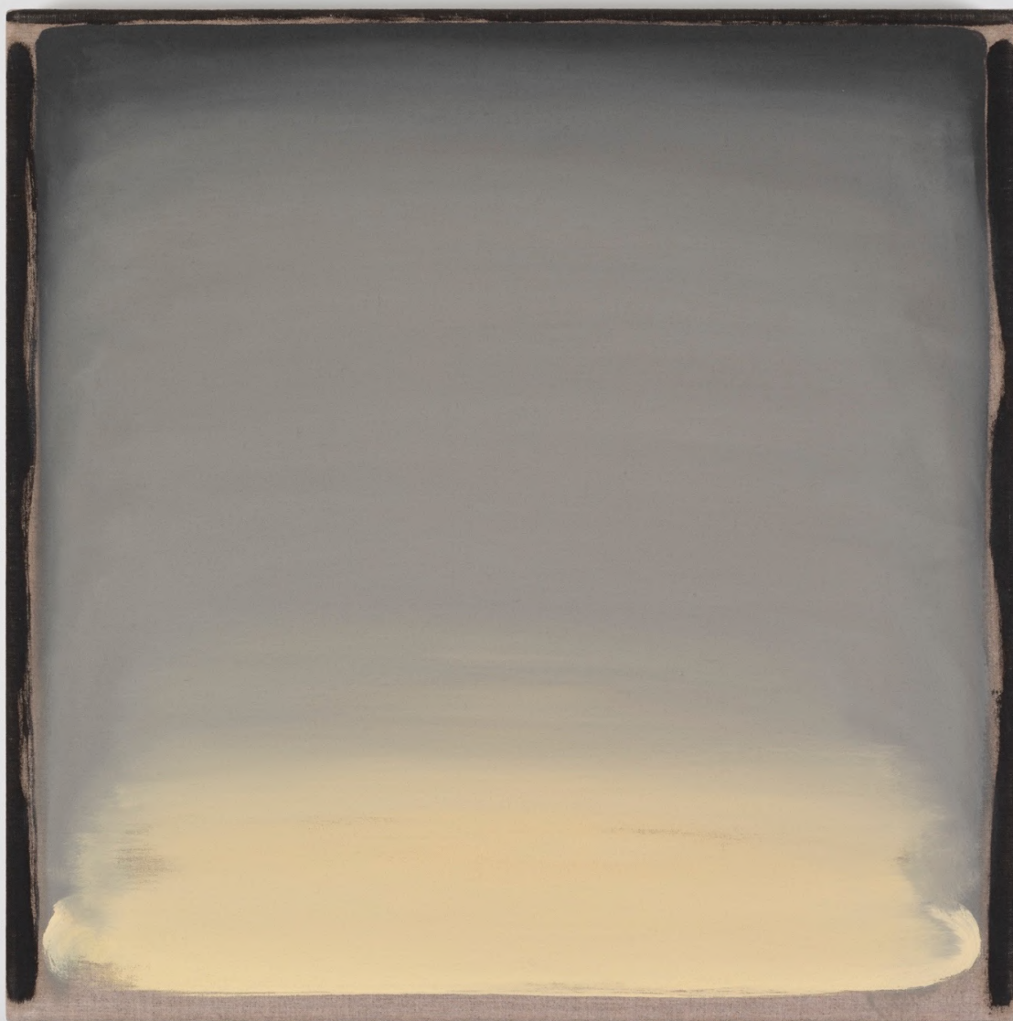
Untitled (2009–2011) oil on linen 45.5 x 45.5 cm / 17.9 x 17.9 in WMcK349