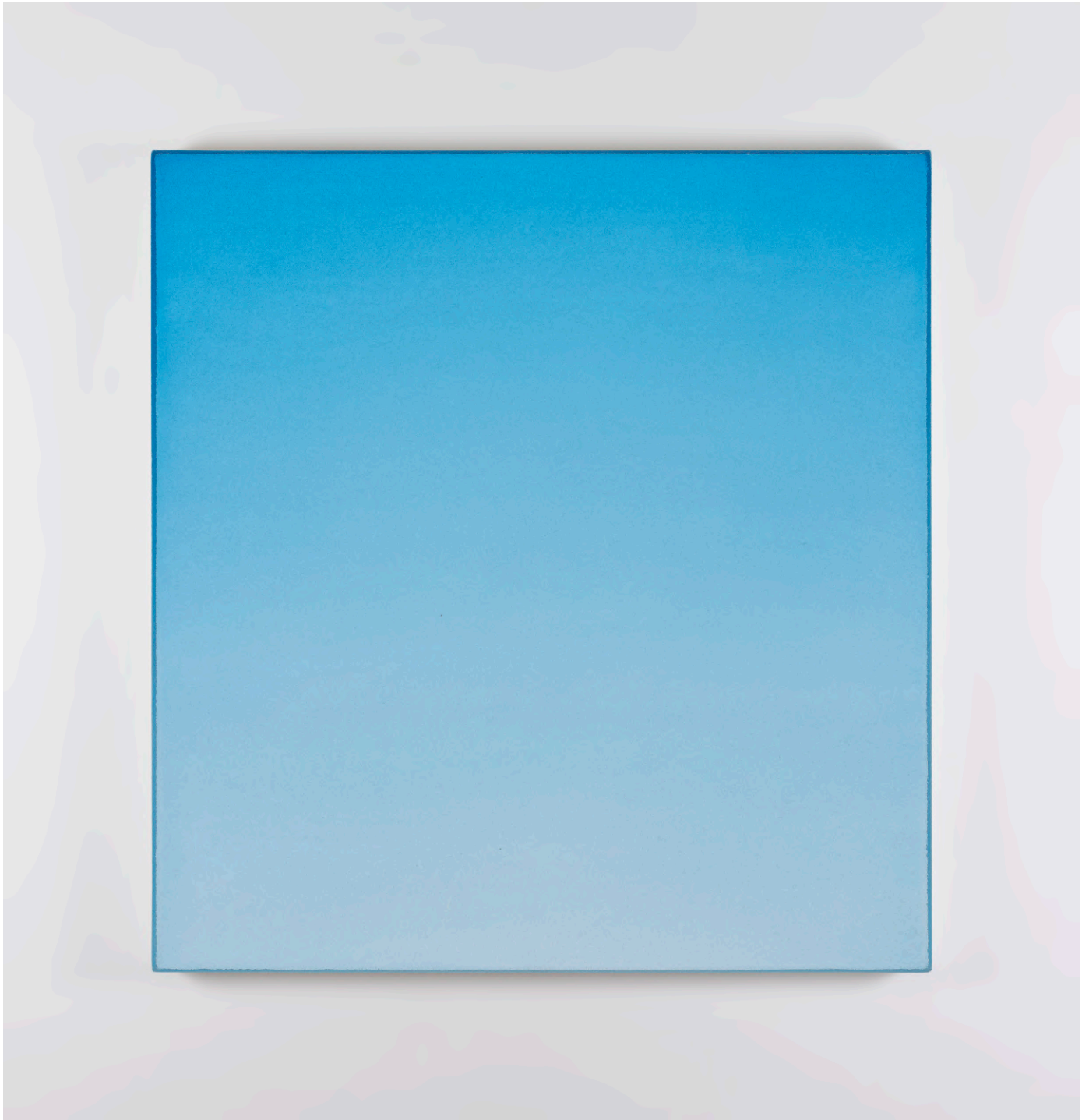
Forever Painting - 3 2002 acrylic on canvas 50.8 x 48.3 cm / 20 x 19 in WMcK1100