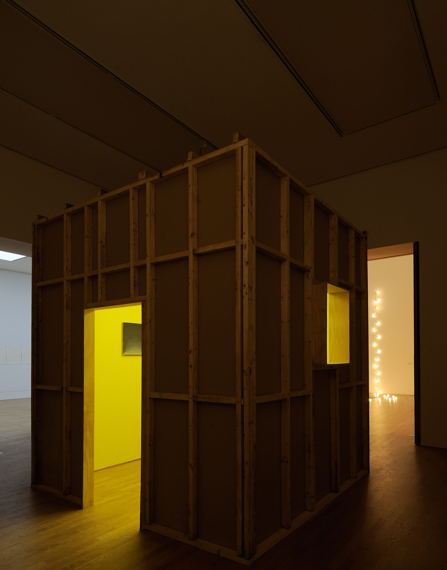
A Certain Distance, Endless Light two-person exhibition with Félix González-Torres MIMA, Middlesbrough, UK 2010