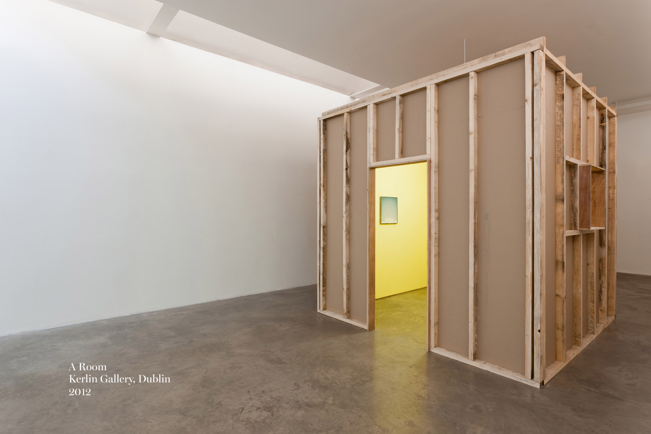
A Room Kerlin Gallery, Dublin 2012