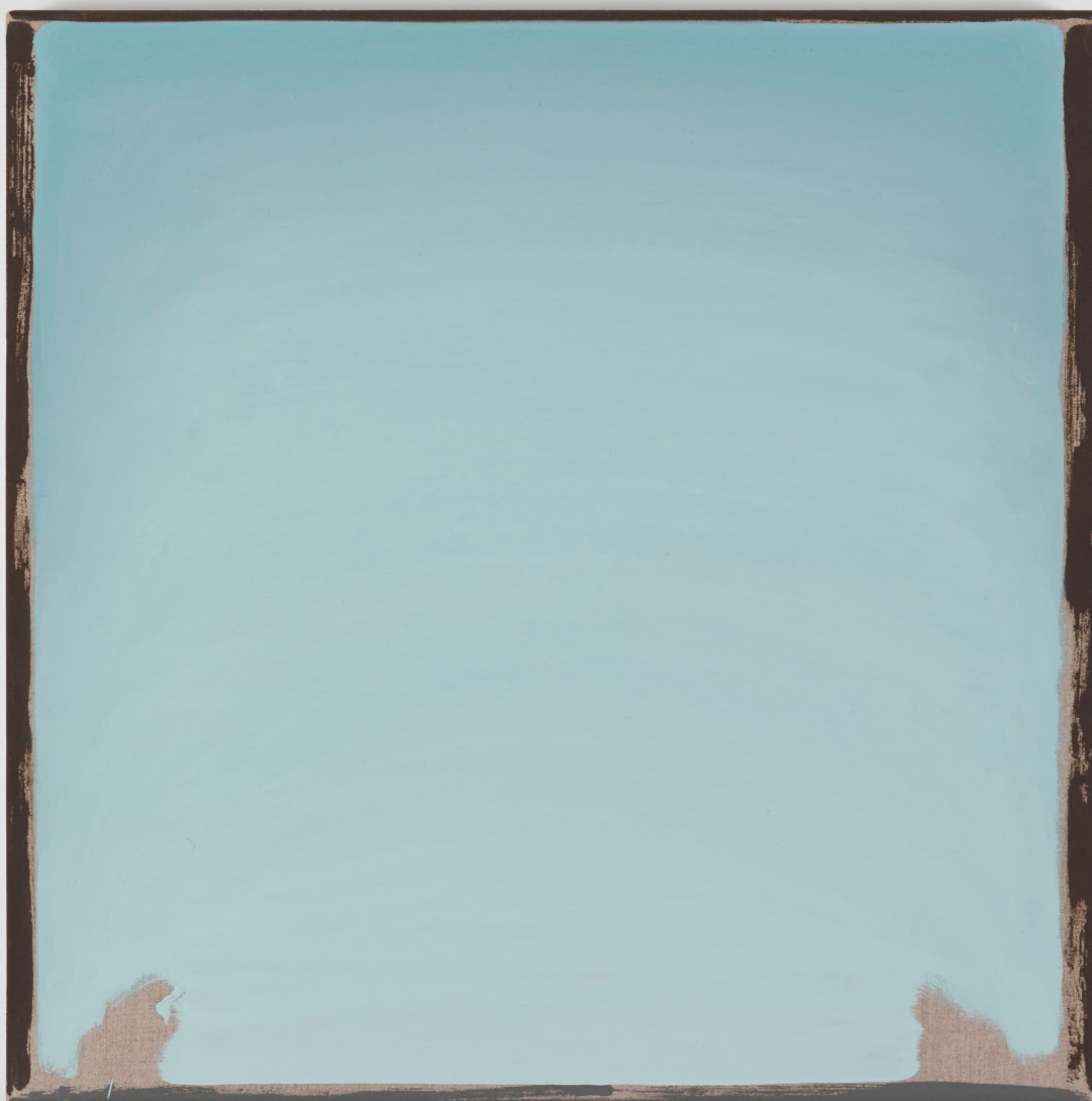
Blue (2009–2011) oil on linen 48 x 48 cm / 18.9 x 18.9 in WMcK318