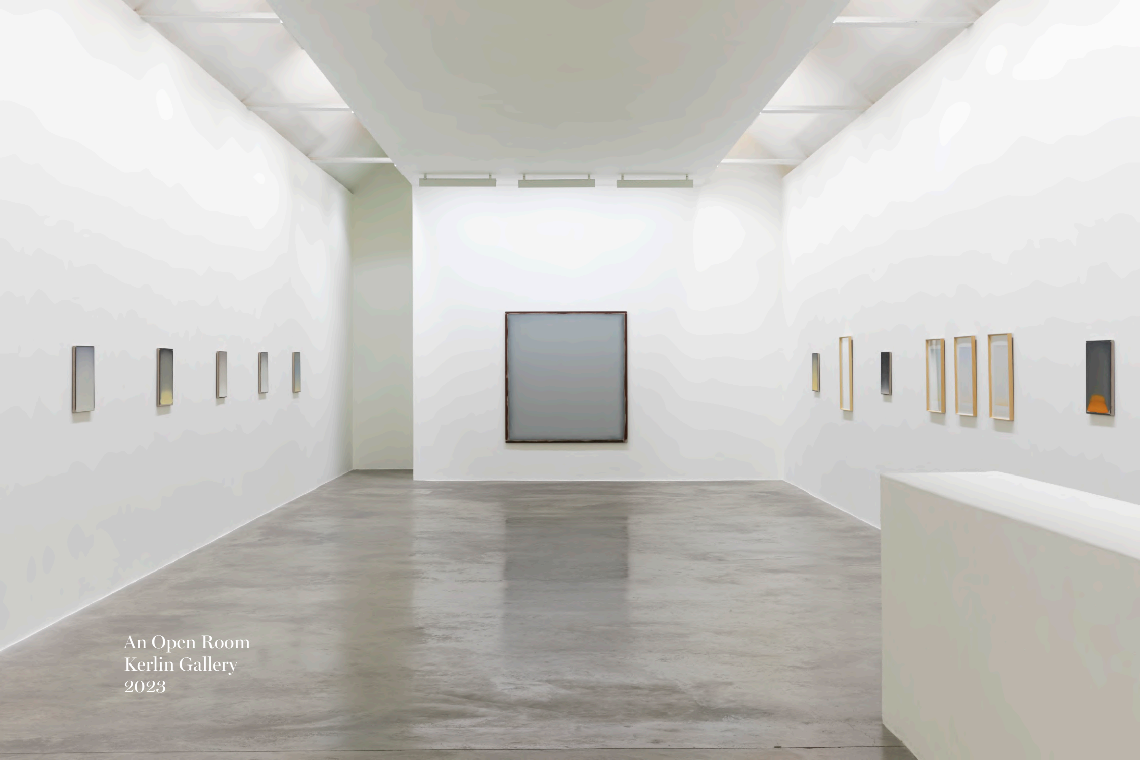
An Open Room Kerlin Gallery 2023