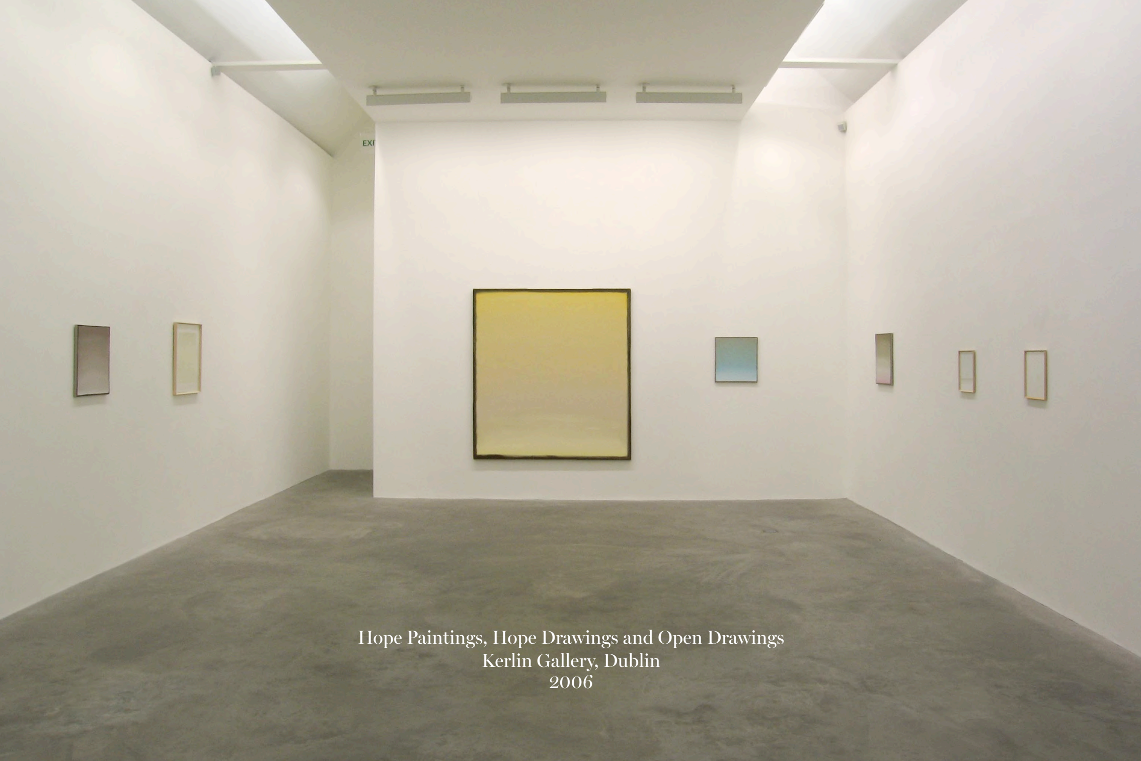
Hope Paintings, Hope Drawings and Open Drawings Kerlin Gallery, Dublin 2006