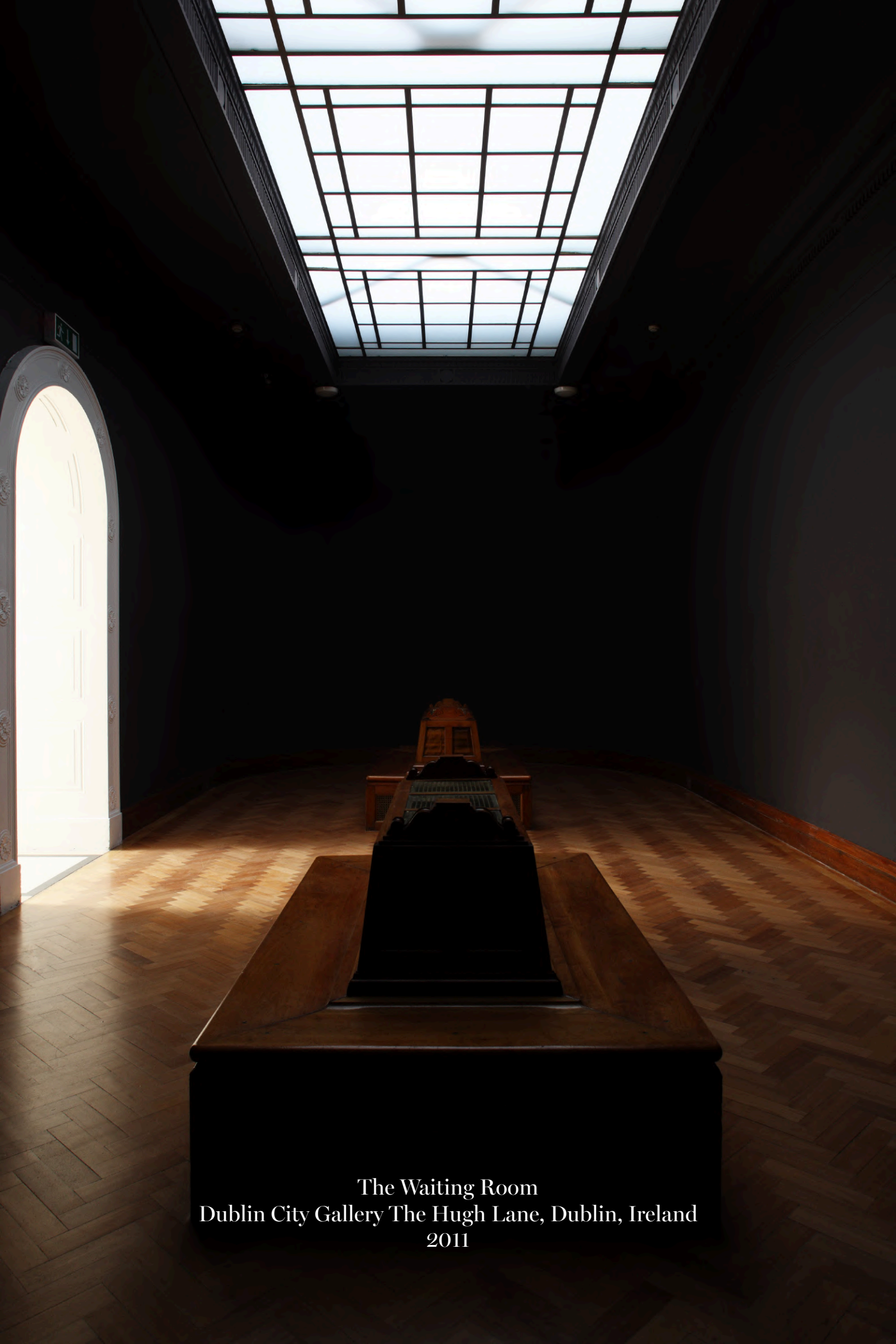
The Waiting Room Dublin City Gallery The Hugh Lane, Dublin, Ireland 2011