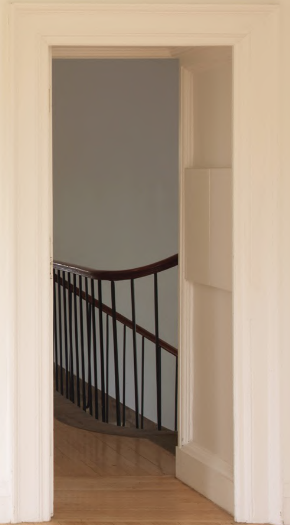
Inverleith House Edinburgh, Scotland 2012