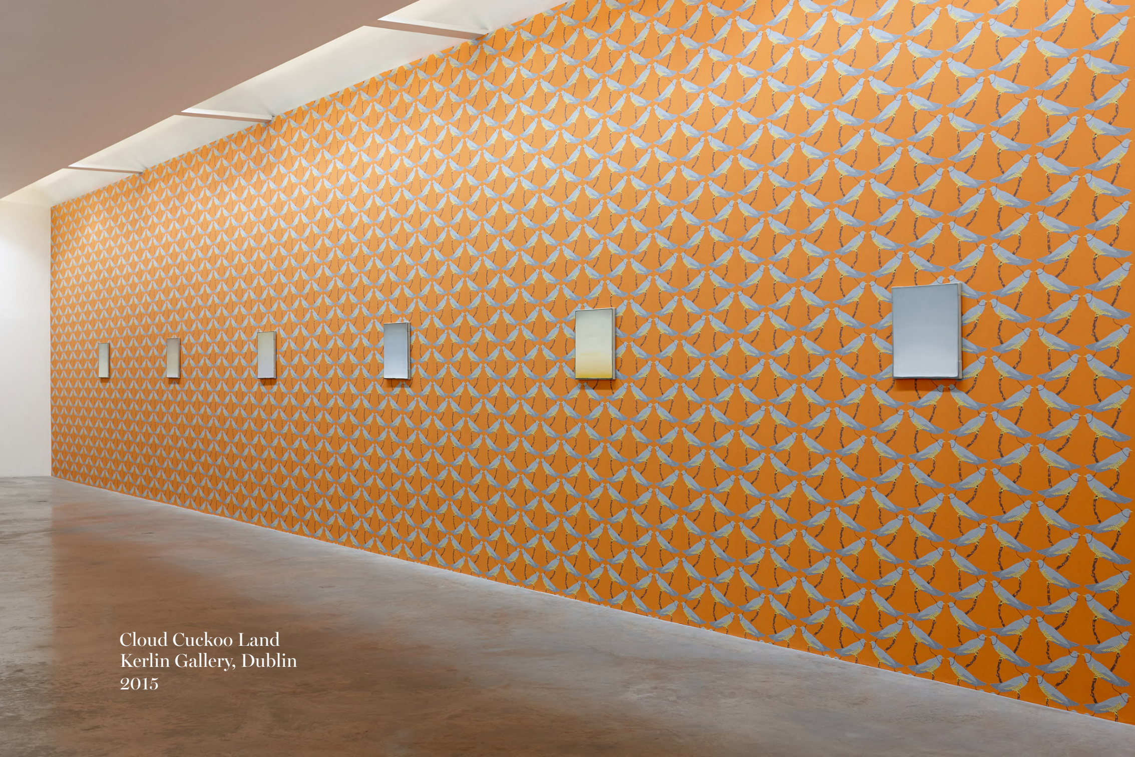
Cloud Cuckoo Land Kerlin Gallery, Dublin 2015