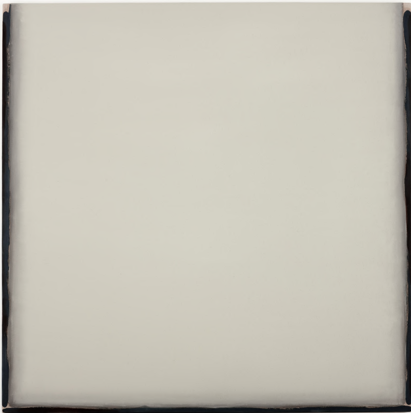
Ocean 2009 oil on linen 182 x 182 cm / 71.7 x 71.7 in WMcK29209