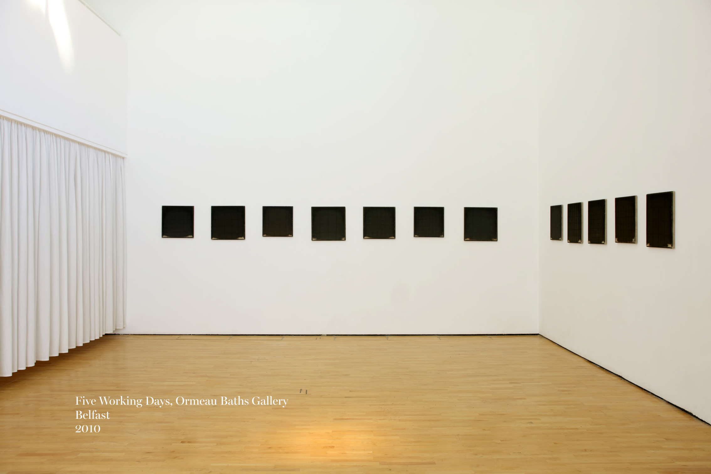
Five Working Days, Ormeau Baths Gallery Belfast 2010