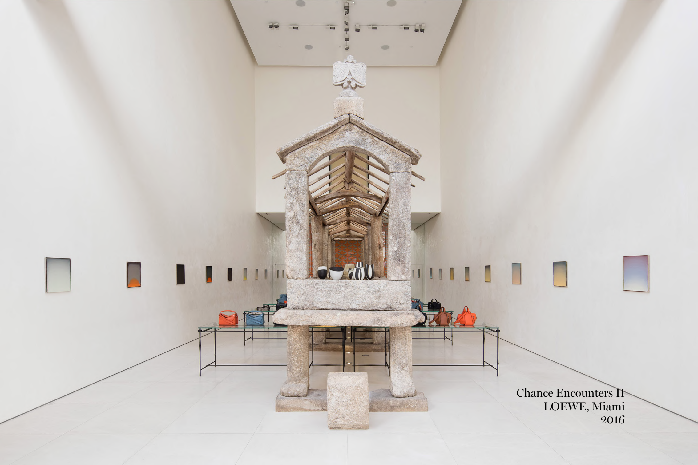
Chance Encounters II LOEWE, Miami 2016