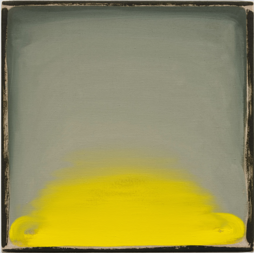
Untitled (2009 - 2011) oil on linen 40.5 x 40.5 cm / 15.9 x 15.9 in WMcK303